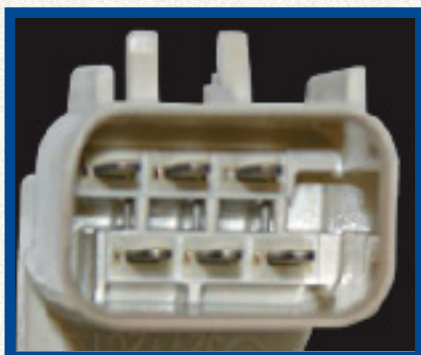
Old Model Connector